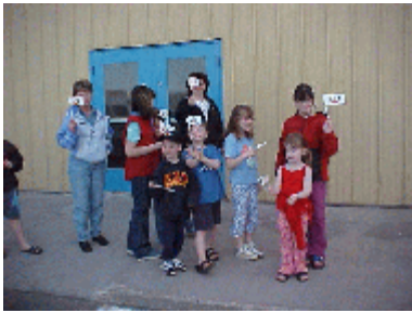
It is time to get ready for the parade.

A lunch then followed and everyone had a very enjoyable and memorable evening.